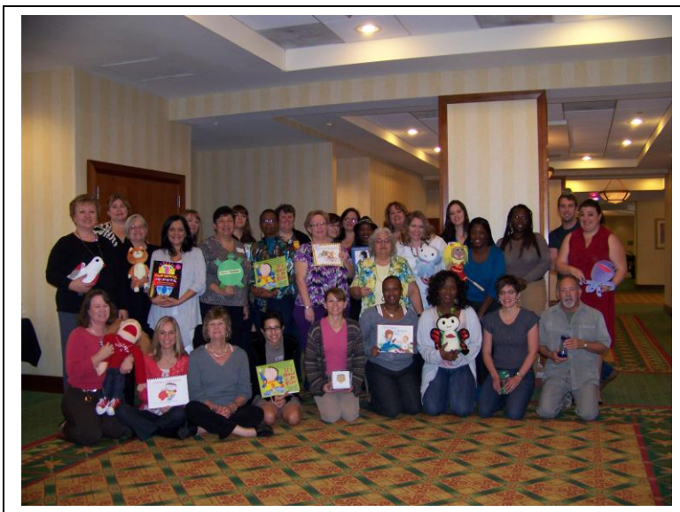
Attendees at the February 2011 PIECE training in Clearwater.

Project PIECE was designed to develop a network of early child care and education providers who would be trained on evidence-based inclusive practices to improve inclusion of young children with developmental disabilities, developmental delays and who are at risk in Florida's early child care and education programs. During the first four years of the project, Pinellas Early Learning Coalition was hired by the Council to develop, implement and provide on-going training, coaching and monitoring for the project. They also identified potential barriers and challenges and assisted with resolution. During that time, PIECE focused on implementing the concept of Positive Behavioral Supports (PBS) in early education centers in order to ensure young children are in a stable and consistent early learning environment and experience success.